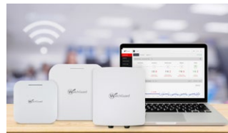
Secure Cloud Wi-Fi